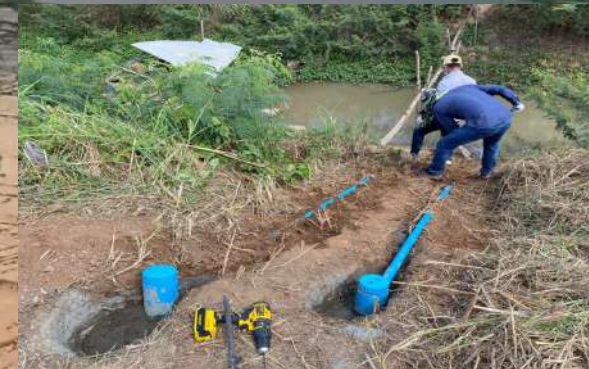
Water Level and EC sensors Installation