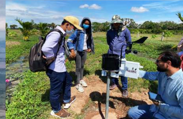
Automatic Weather Station Installation