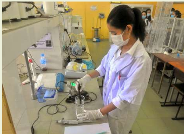
Activity of physicochemical analysis of water