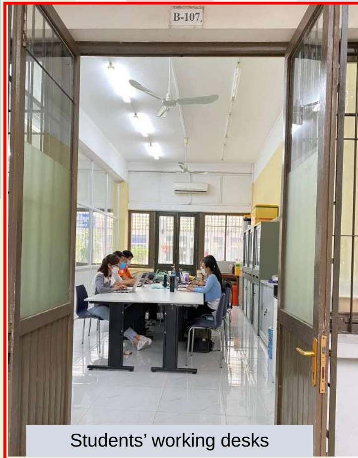
Students' working desks

Address: PO Box 86, Russian Federation Blvd, Phnom Penh